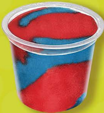
Cherry Blue Raspberry Fat free, cherry and blue raspberry frozen snack made from 100% fruit juice.