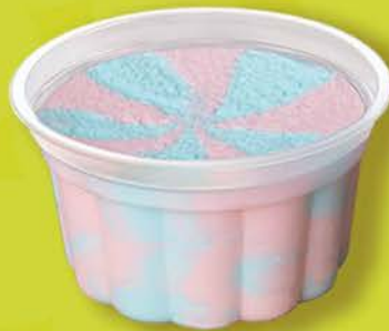
Cotton Candy ● Single serving of a low fat cotton candy ice cream. ▲