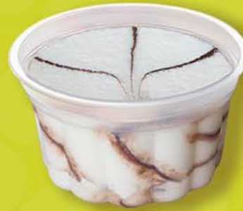
Chocolate Sundae ● Single serving of a low fat vanilla ice cream with chocolate sauce. ▲