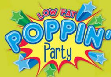
Poppin' Party ● Single serving of blue low fat cotton candy ice cream with popping candy in a plastic cup.