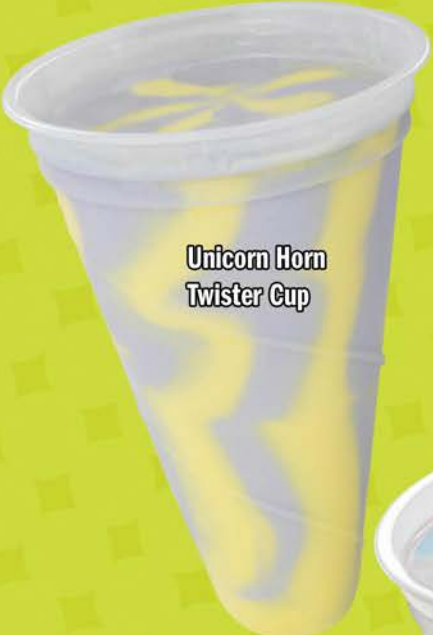
Unicorn Horn Twister Cup