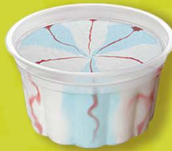
All-Star Sundae ● Single serving of low fat blue and white vanilla ice cream with berry flavored sauce. ▲