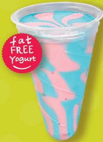
Cotton Candy ● Fat free, cotton candy flavored frozen yogurt twister cup.