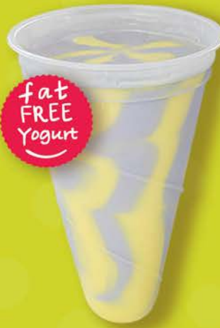
Unicorn Horn ● Fat free, birthday cake flavored frozen yogurt twister cup.