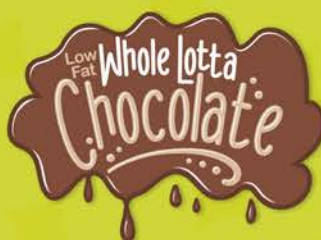
Whole Lotta Chocolate ● Single serving of low fat chocolate ice cream with chocolate sauce in a plastic cup.