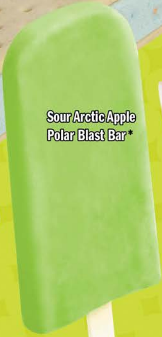
Sour Arctic Apple Polar Blast Bar*