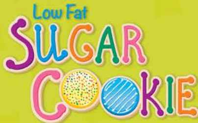
Sugar Cookie ● Single serving of low fat sugar cookie ice cream with rainbow sprinkle in a plastic cup.