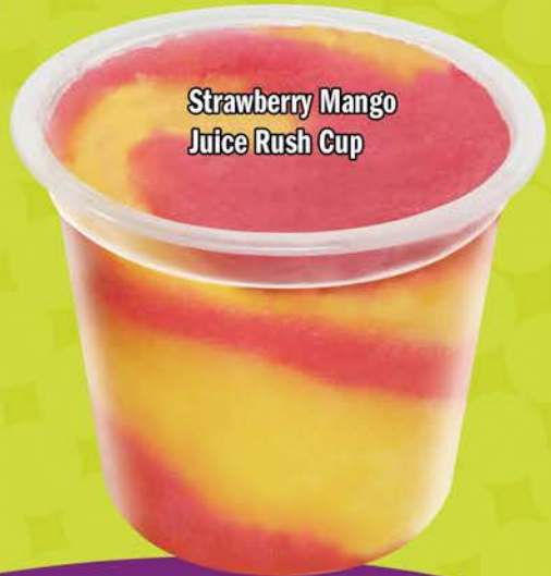
Strawberry Mango Juice Rush Cup