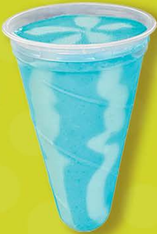
Sour Blue Raspberry ● Fat free, sour blue raspberry fruit juice twister cup.