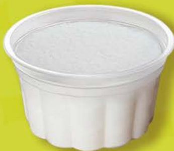
Vanilla ● Single serving of low fat vanilla ice cream. ▲