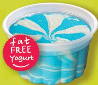
Birthday Cake ● Single serving of fat free birthday cake yogurt. ▲