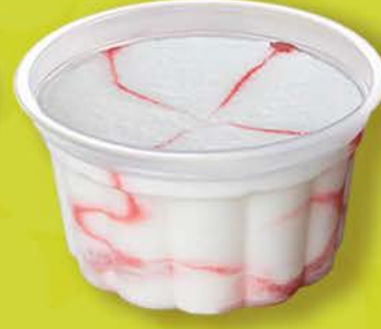
Strawberry Sundae ● Single serving of low fat vanilla ice cream with strawberry sauce. ▲