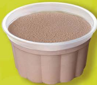
Chocolate ● Single serving of low fat chocolate ice cream. ▲