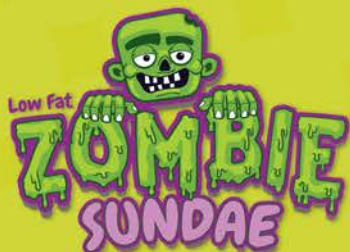
Zombie Sundae ● Green and purple low fat vanilla ice cream with chocolate sauce.