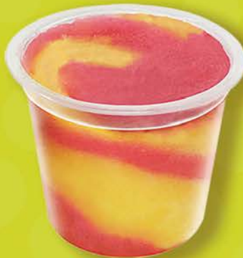
Strawberry Mango Fat free, natural strawberry mango flavored frozen snack made from 100% fruit juice.