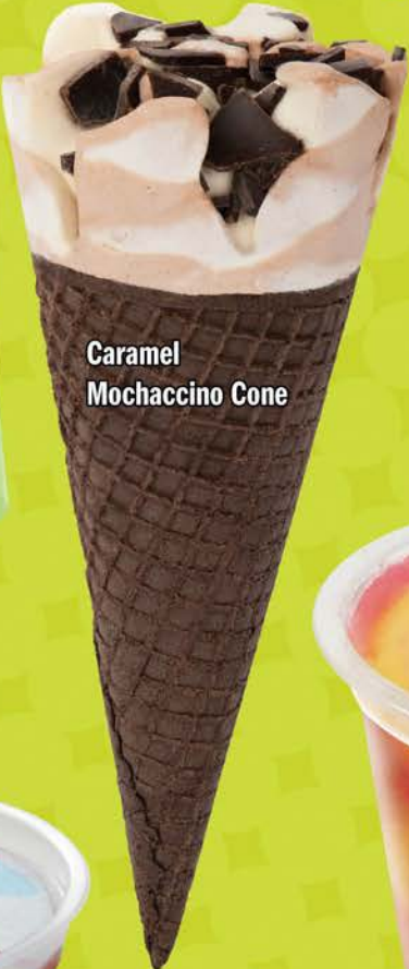
Caramel Mochaccino Cone