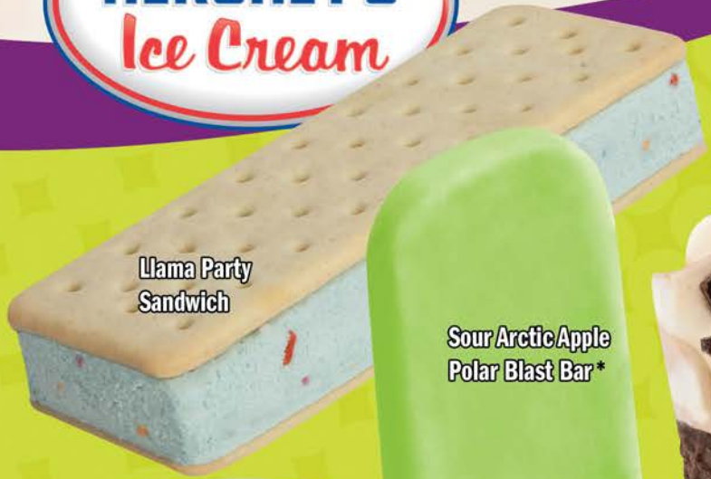
Llama Party Sandwich